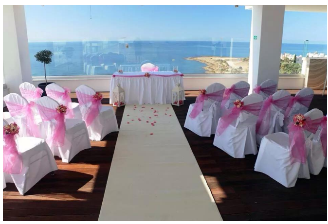
BE OPEN OR CLOSED