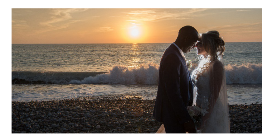
Where the Tsokkos Wedding Team will turn your dream into relaity

web: MyCyprusWed.com | email: weddings@tsokkos.com